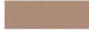
Terra Cotta 6%