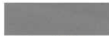
Charcoal Black 2%