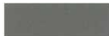
Charcoal Black 5%