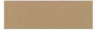
Harvest Gold 3%