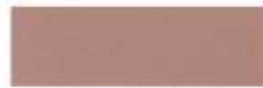
Canyon Red 1.5%