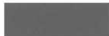
Charcoal Black 7.5%