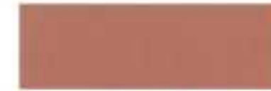
Tile Red 4%