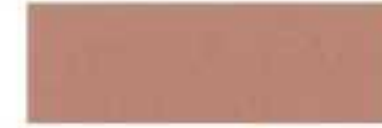
Tile Red 2%