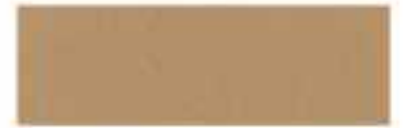
Harvest Gold 6%