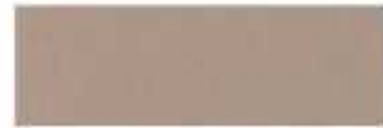
Terra Cotta 1.5%